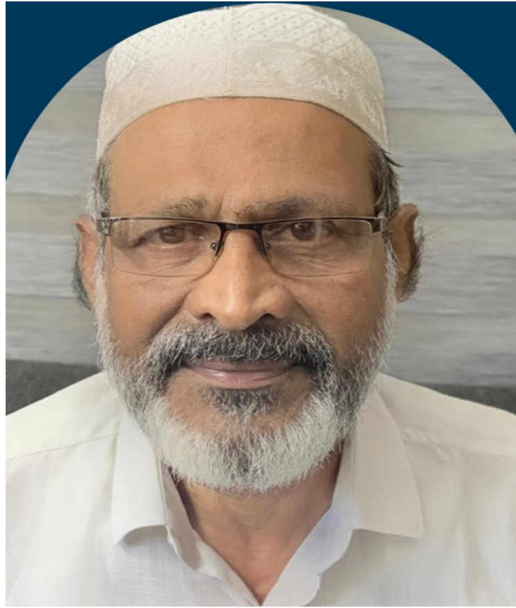
NATIONAL PROMOTERS HANEEPH. N.P.