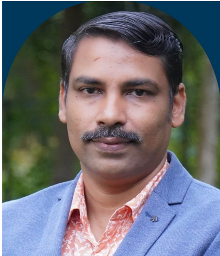
NATIONAL PROMOTERS SHEMEER. O.A.